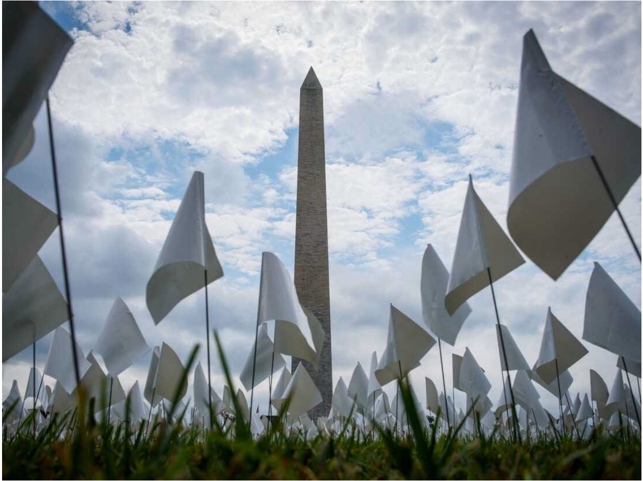
Illustration of Covid Memorial at National Mall in Washington, D.C.